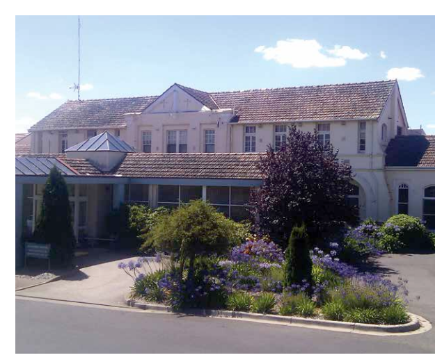
The aged care facility located in Daylesford

HHS strives to operate in a manner that protects the environment, including the health and safety of staff, patients, residents, clients and visitors, and to provide continual education and impact monitoring to ensure quality improvements.