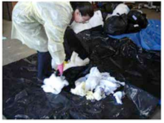
Material sorting during a waste audit